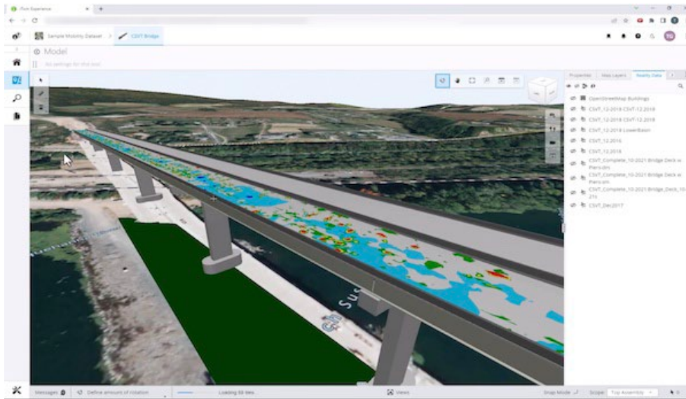
iTwin Experience.