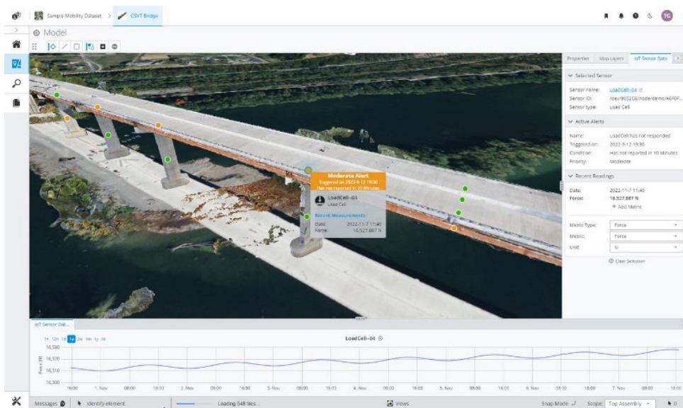
iTwin IoT.